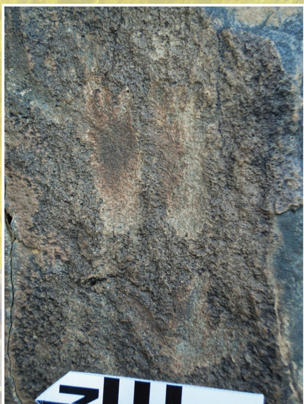
Figure 4. Human foot engravings from La Porfiada archaeological locality.

During rescue works, the presence of engravings and paintings was identified at La Porfiada, a basaltic outcrop located South of the River, in its middle Basin (figure 1). Information obtained at rockshelters La Porfiada 1 and 2 indicates the presence of negative hand stencils and engravings, including in the last case human foot, threedigits, a guanaco image and geometric motifs (figures 4, 5 and 6). It is worth mentioning that, although there are guanaco engravings to the North of the river, there are differences in the technique used between the one identified at La Porfiada 1 and the ones recorded in the basaltic canyons to the North (e.g. Franco 2005 and pers.obs., Fiore 2017, Fiore & Ocampo 2009). The presence of guanaco engravings have been mentioned to the South, although there are not still detailed descriptions published (Manzi et al. 2017). In none of the sites located South of the river, the presence human foot engravings have been identified, being the case of La Porfiada 1 an exception.