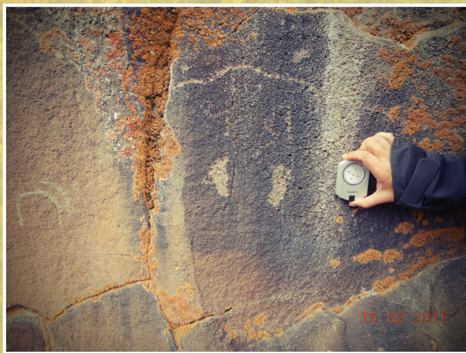
Figure 2. Human foot engravings (La Estelita).

There are not dates for rock art in the basin. However, clear differences are present North and South of the River. Engravings are frequent in basaltic canyons located to its North, and less frequent to the South (Charlin & Borrero 2012, Gradin 1987, Menghin 1957). We agree with Charlin & Borrero (2012) about the relevance of this difference, especially considering the better preservation potential of engravings in relationship to paintings.