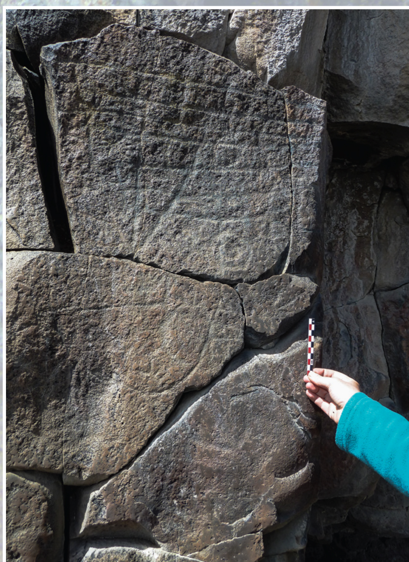
Figure 6. Guanaco engraving at La Porfiada 1.

Lithic technology recovered in surface contexts at La Porfiada 1 and 2 shows similarities with the one recorded between ca. 6,100 and 3,800 yr BP at the Upper Santa Cruz river (i.e. Franco et al. 2011, 2016, 2017a).