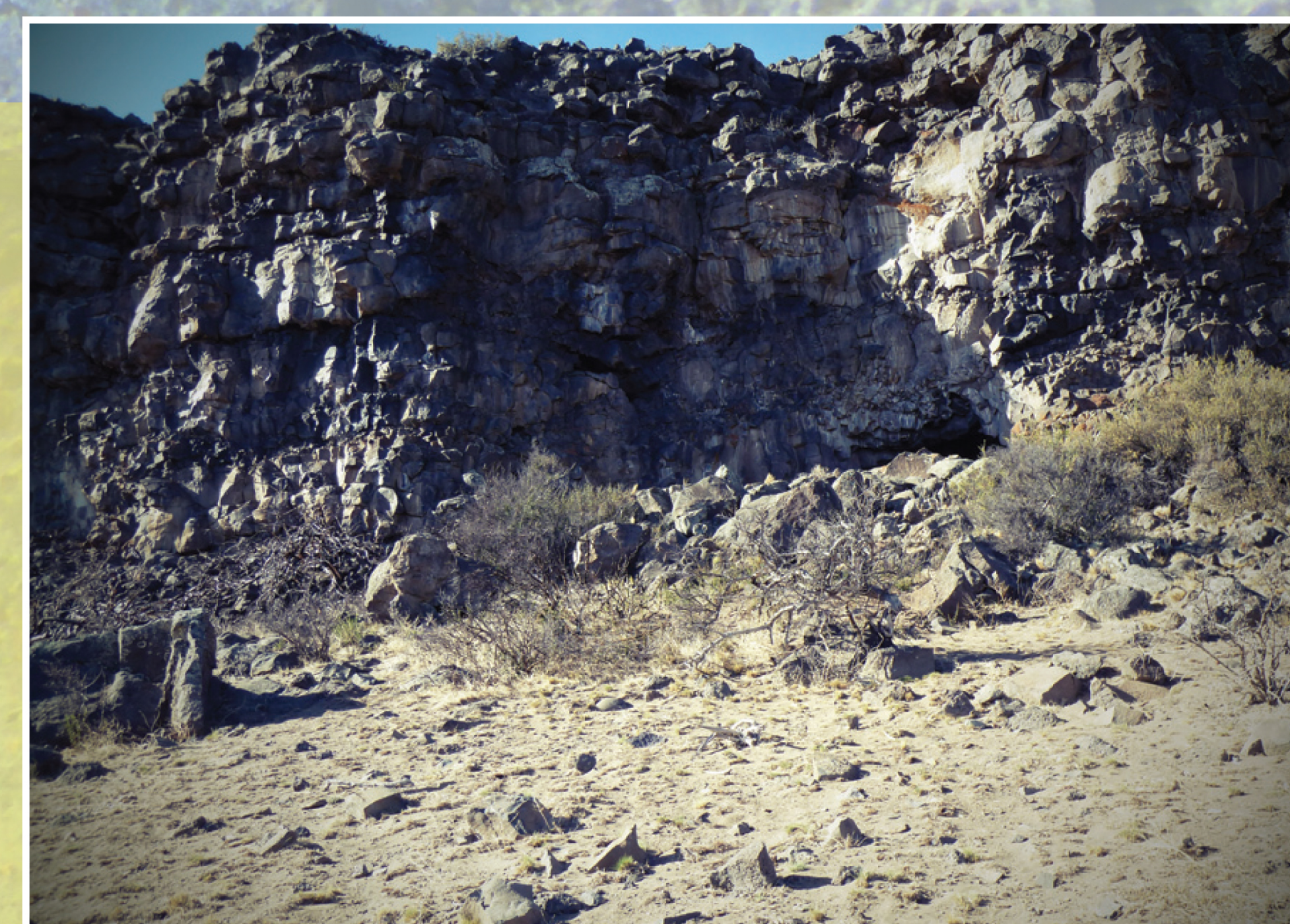
Figure 3. La Porfiada 1