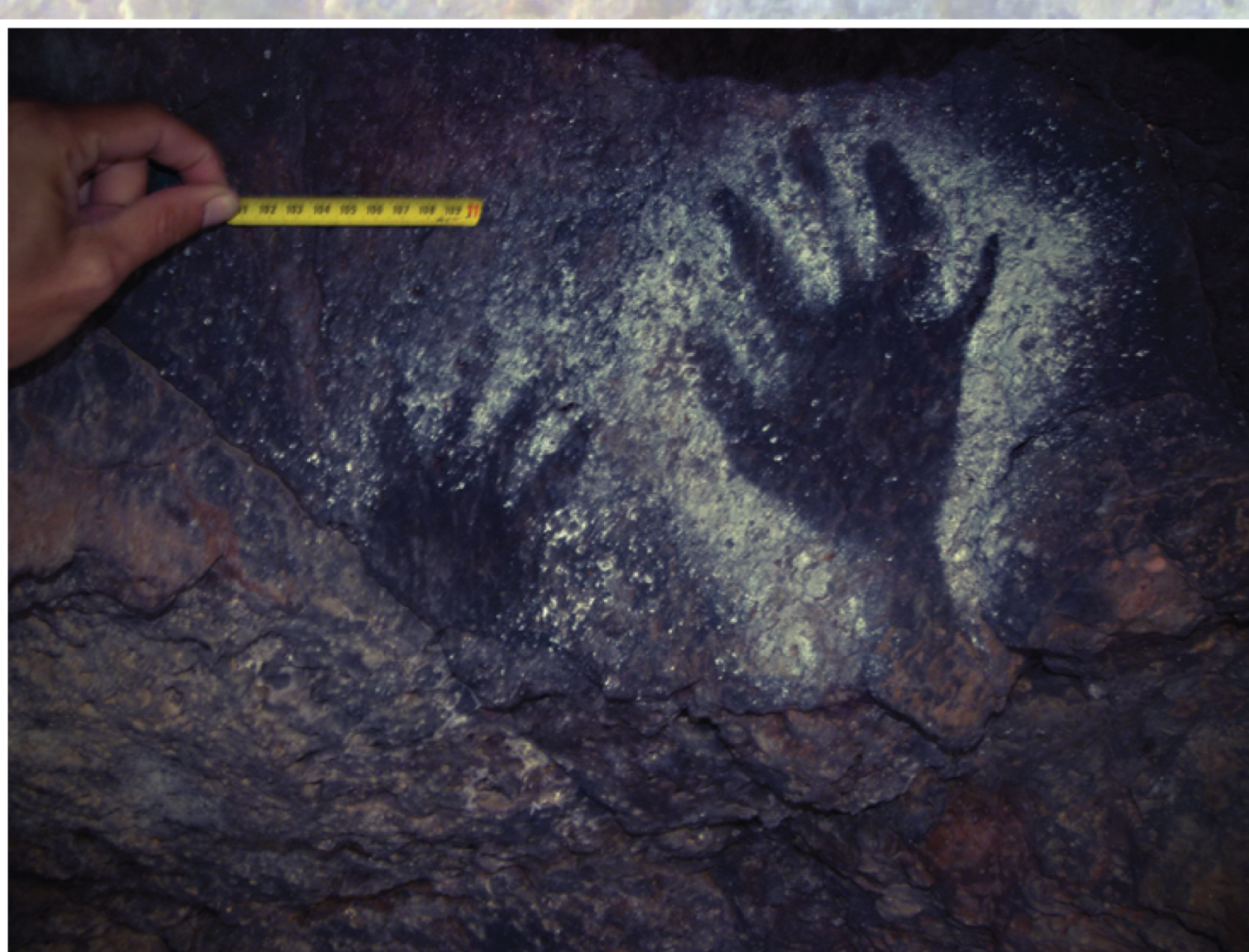
Figure 5. Negative hand stencils at La Porfiada archaeological locality.

In addition, engravings have not been identified in the Upper Santa Cruz Basin, an area where motifs and techniques show similarities with the ones present to the South, both in Argentine and Chilean Patagonia (Charlin & Borrero 2012). In the Upper Santa Cruz River Basin, hand negative stencils were only identified at Punta Bonita-Walichu archaeological locality (figure 1).