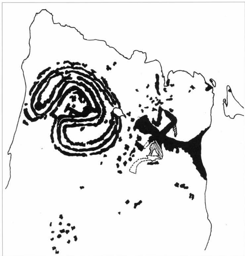
Fig. 57. Painting of labyrinth and anthropomorphic figure, Polyphemus Cave (Grotta/Riparo di Polifemo), Bonagia (Trapani), Sicily. (Tracing by M. Rigoglioso).