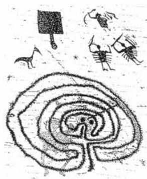
Fig. 58. Classic, seven-path labyrinth. Fig. 59. Labyrinth in the rock engraving of Valcamonica (Brescia), Italy. (After E. Anati).

image on an inscribed clay tablet found at Pylos, Peloponnus, Greece (this one is rectangular, rather than circular) (Fisher & Gerster, 1990, p. 26). Another early labyrinth is the rock carving in Valcamonica mentioned previously; this has been dated to as early as between 1800 and 1000 BC (Lonegren, 1991, p. 25), but other estimates place it much later, to between 750 and 550 BC (Fisher & Gerster, 1990, p.12). The earliest date ever estimated for a classic, seven-path labyrinth is 2500-2000 BC, for an image on a rock carving found inside the "Tomba del Labirinto", a tomb at Luzzanas in Sardinia (Fisher & Gerster, 1990, p. 26). Later burials make this estimate uncertain, but even were it to be correct, the Polyphemus labyrinth would still be the oldest labyrinth in the world by at least 500 years.