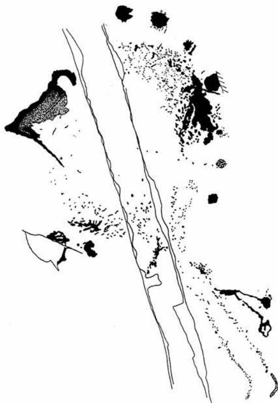
Fig. 52. The body of a human figure disappears in the cracks. The Valley of Tamgaly, Kazakhstan. The scale is 10 cm. (rilievo A. Rozwadowski).