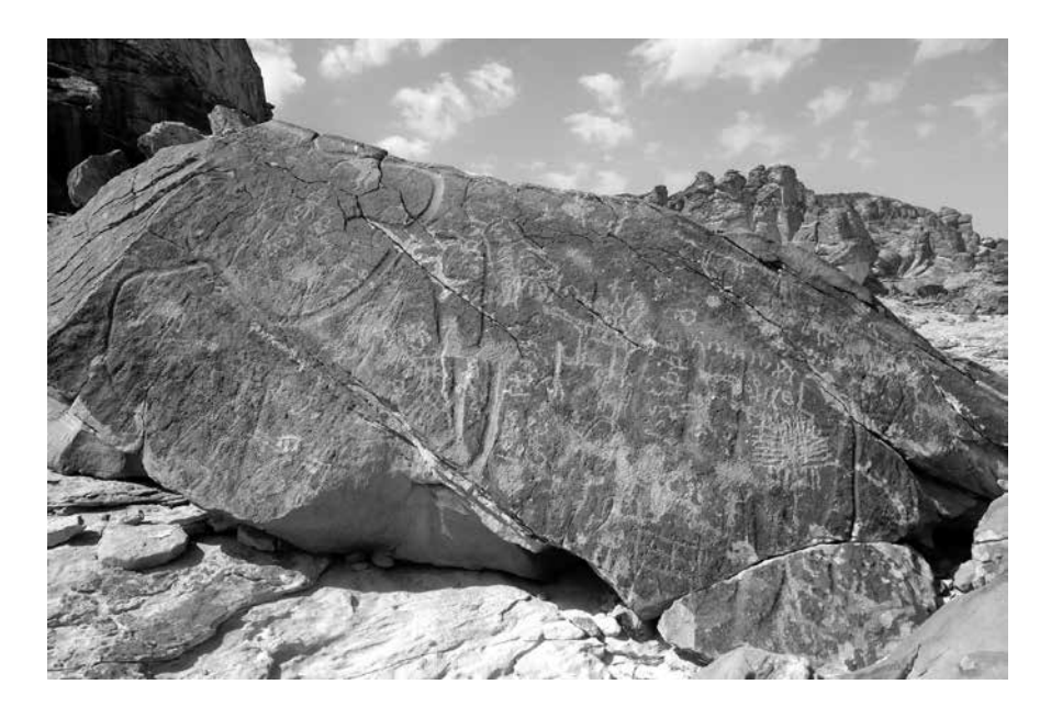
Fig. 2 - Large bovine figure of the Neolithic with numerous superimposed motifs of Bronze and Iron Ages, Jabal Umm Sinman.

Fig. 1 - Some of the sites subjected to scientific investigation in Saudi Arabia, 2002 to 2015: 1 – Jabal umm Sinman complex; 2 – Janin Cave, Janin main site, Milihiya, Yatib; 3 – Shuwaymis complex; Jabal al-Bargh; 4 – Qilat al-Hissan; 5 – Umm Asba'a; 6 – Al-'Usayla; 7 – Jabal Qara precinct.