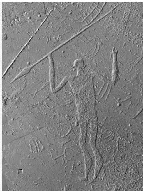
Fig. 4 - SfM-documentation of Litsleby with texture and without – left and right photo. The red paint making the carving more visible to the visiting public still has a major drawback in that it smoothens the carved surfaces and hiding important details.