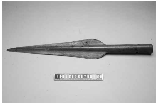
Fig. 5a - Bronze spearhead from period II of the Nordic Bronze Age found at Gästgivaretomten in Falköping, Västergötland in 1867.