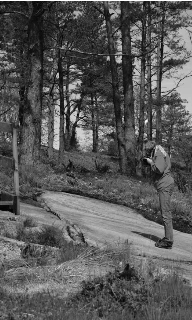
Fig.2 - Catarina Bertilsson photographs Tanum 18:1 on the backside of Aspeberget for Structure from Motion documentation.