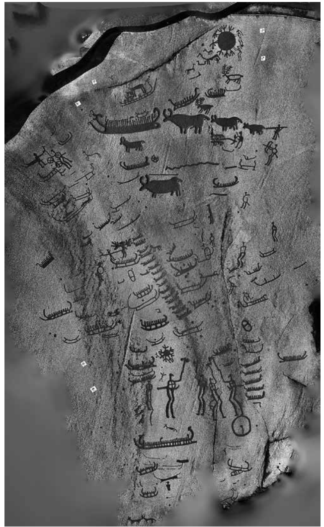
Fig. 3 - The rock carving Tanum 12 at Aspeberget documented by Structure from Motion and here presented with full texture exported as a snapshot from AGI Soft. The surface of the rock carving is approx. 120 square meter and the number of cameras = photos are 1517.