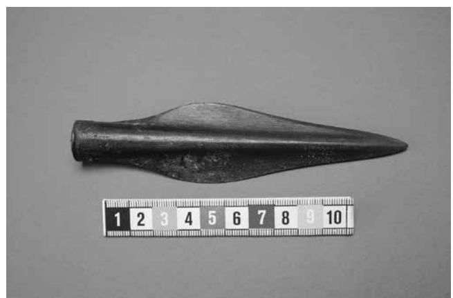
Fig. 6 - Bronze spearhead from period II of the Nordic Bronze Age found in a barrow at Hulterstad, Öland in 1933.