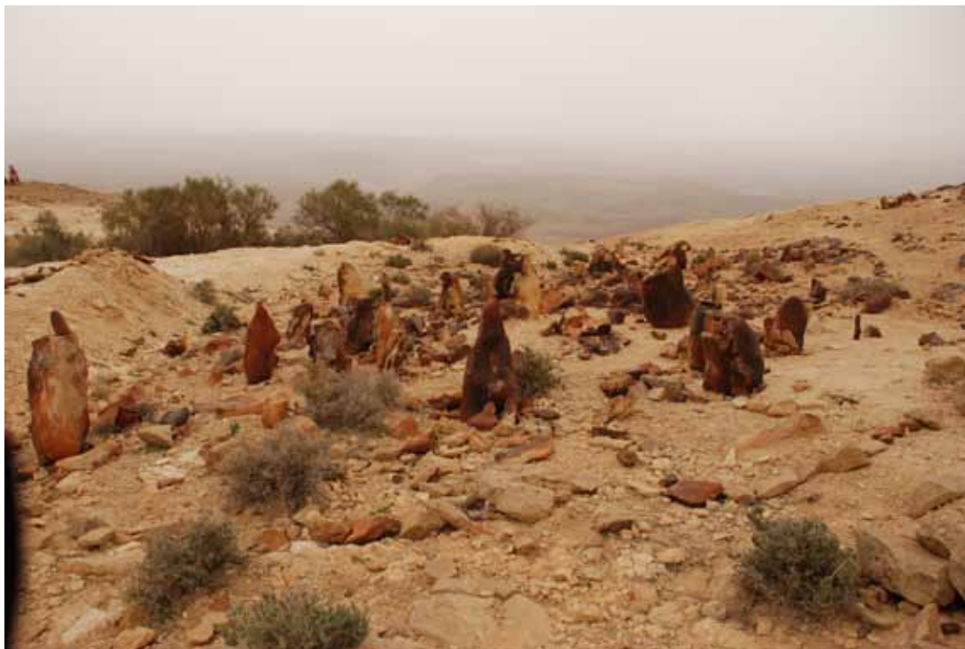
Figure 2: HK/86b - the flint pillars with the geoglyphs in front