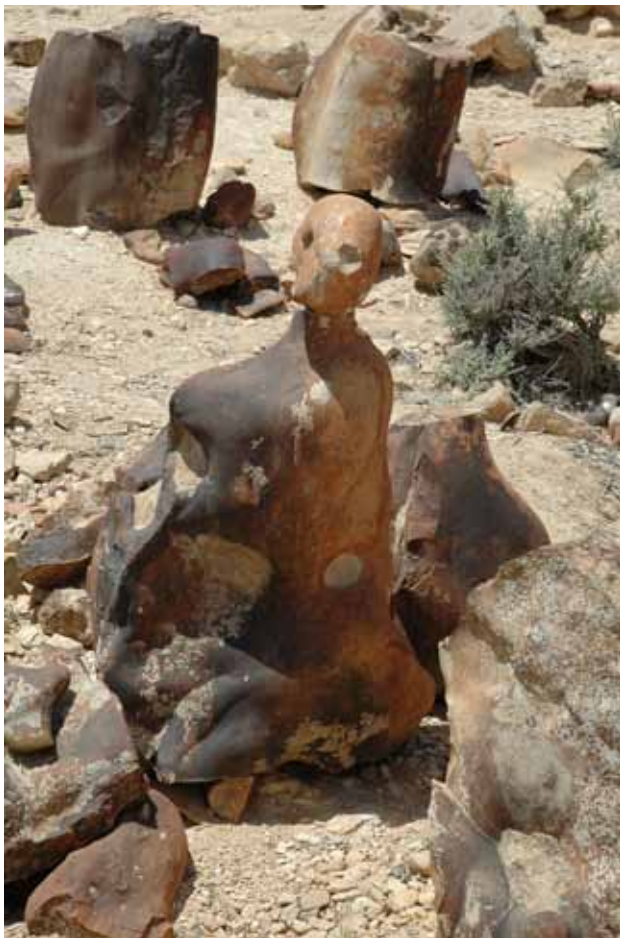
Figure 3: HK/86b – particular of an anthropomorphic pillar