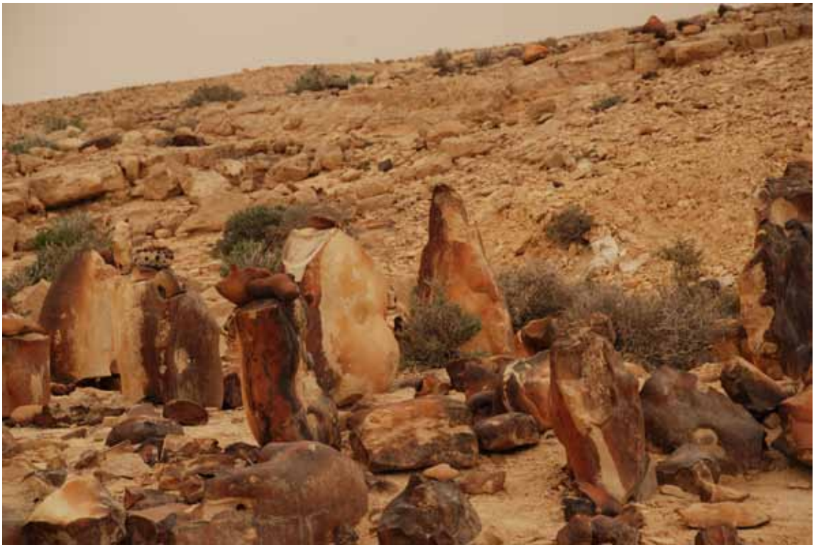
Figure 4: HK/86b – particulars of anthropomorphic pillars