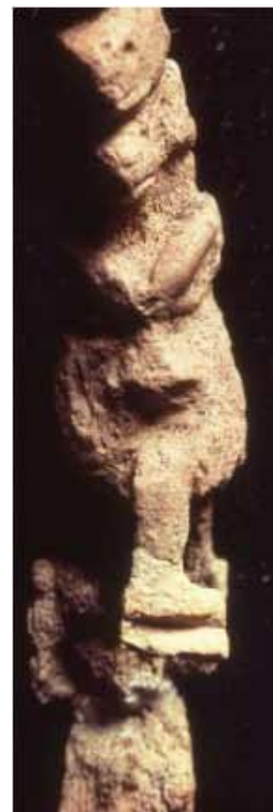
Fig. 1. Ritual spoon from the Pender Canal site dating 2000 B.C. (calibrated). The ovals on the back of the spoon are joint marks The back of the spoon shows joint marks and the open back of the mask. The face on the front of the spoon is the mask of a mythological being with a protruding tongue.