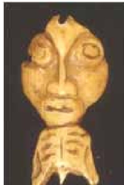
Fig. 3. Images showing bones. Left: handle of a spoon with a salamander image with joint marks and ribs from the Pender Canal site dating ca.1500 B.C. Center: rockfish with external backbone from Pender Canal spoon handle dating ca 2000 B.C. Right: pendant from the Marpole site showing ribbed human dating ca. 1 A.D.