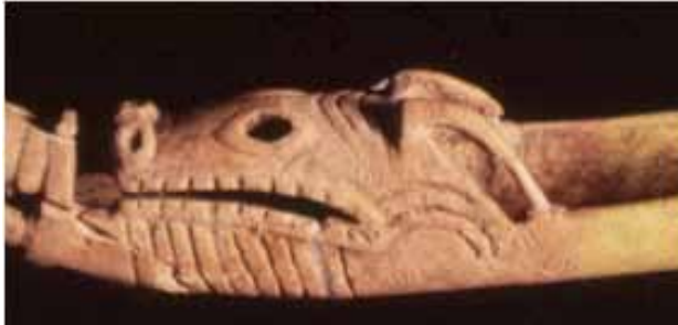
Fig. 2. Images of a sea wolf mask (top and center) and mountain goat mask carved on spoon handles from the Pender Canal site dating 2,000 B.C. (calibrated date). The sea wolf is confronting a rockfish. Both masks are hollow and have an opening in the base for the head of the wearer as in contemporary forehead masks.