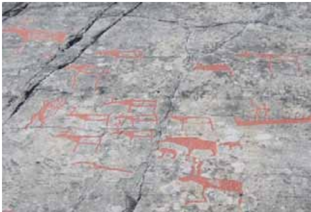
Fig. 3. Alta, Post 11: 4200-4200-3600 A scene of hunters both from the land and sea with images of reindeer, elk, and bears. The images may have meanings that are both individual and in connection with each other.