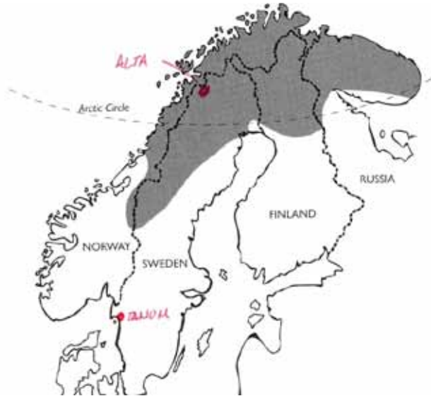
Fig 2. Location of Alta, Norway above the Arctic Circle and Tanum Sweden to the south.