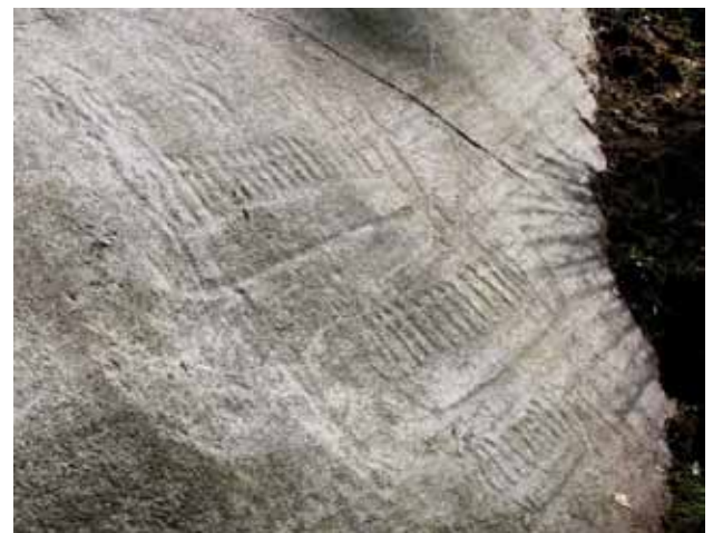
Fig. 5a and 5b: Tanum, Sötetorp T-356:1 Ship images in natural light (approx. 15:00) and a frottage of the same images. The ships are ca. 900-700 BC, the lowest one currently lies just a few centimeters above the ground level( photos by author 2009; both are property of Scandinavian Society for Prehistoric Art).