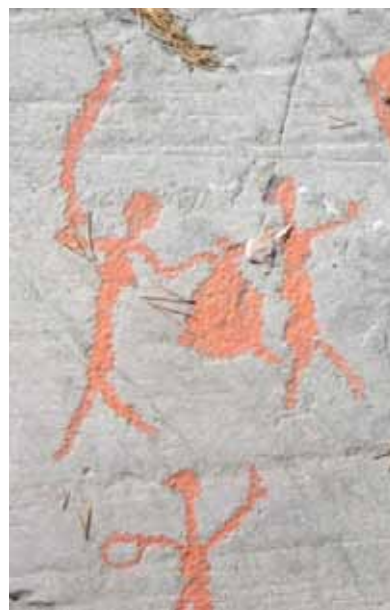
Figs. 4a and 4b. Alta Post 11: 4200-3600 BC. The rock art image on the left shows two people possibly holding a bird, while the person in the foreground might have a drum. If so, drums might have been used in the area up to 8000 years ago. The photo of a Sami drum from the University of Tromsø, Norway Museum on the right shows similar images as those found in the carvings including a bird like figure in the upper left. More research has to be done to truly state that the carvings were done by the ancestors of the Sami.