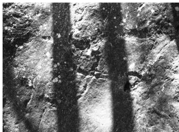
Photo 4. Cross, circle and snake.