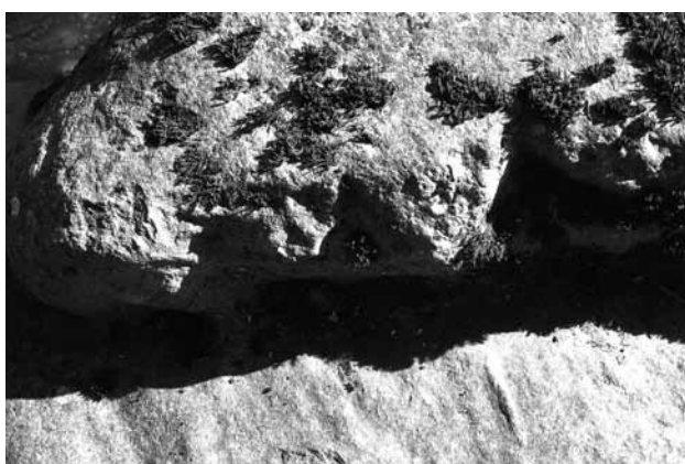
Photo 7. Triangles from the fishes.