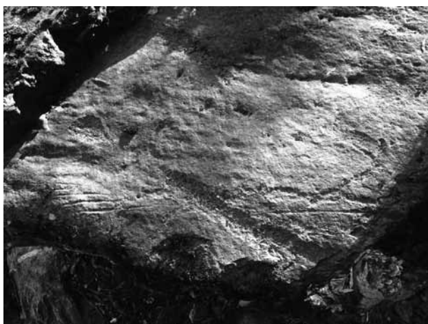
Photo 5. Fishes from Pena.