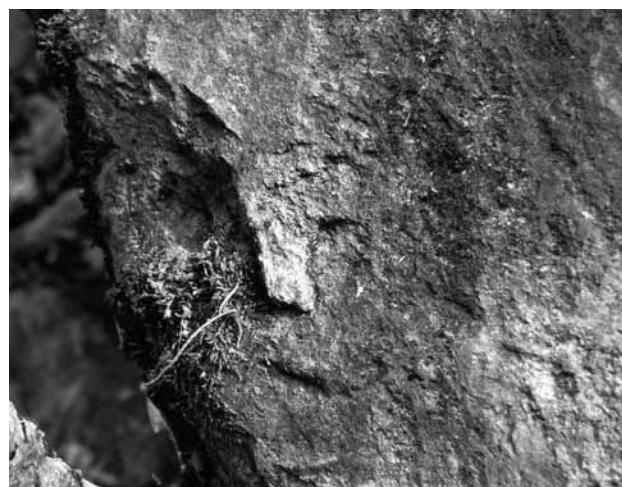
Photo 6. Human head.