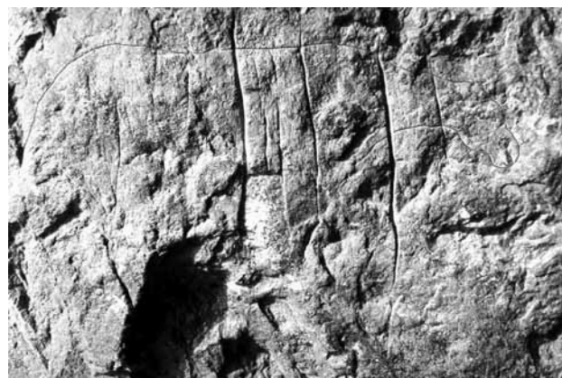
Fig. 8 - Caviglione Cave. An outstanding carved figure of a horse in naturalistic style, outlined in lateral perspective, associated with linear strokes deeply carved by the "polissoir" technique.