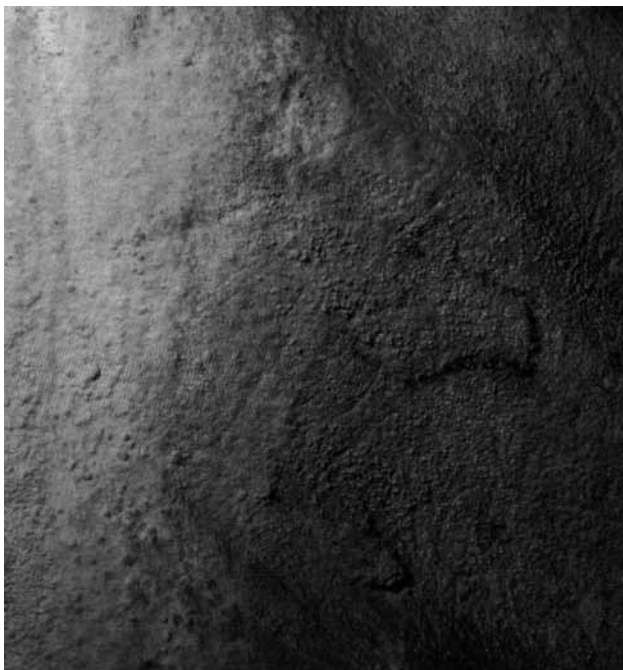
Fig. 3-Horse Head