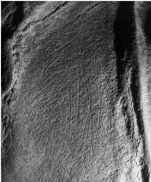
Fig. 1-Three heads of horses