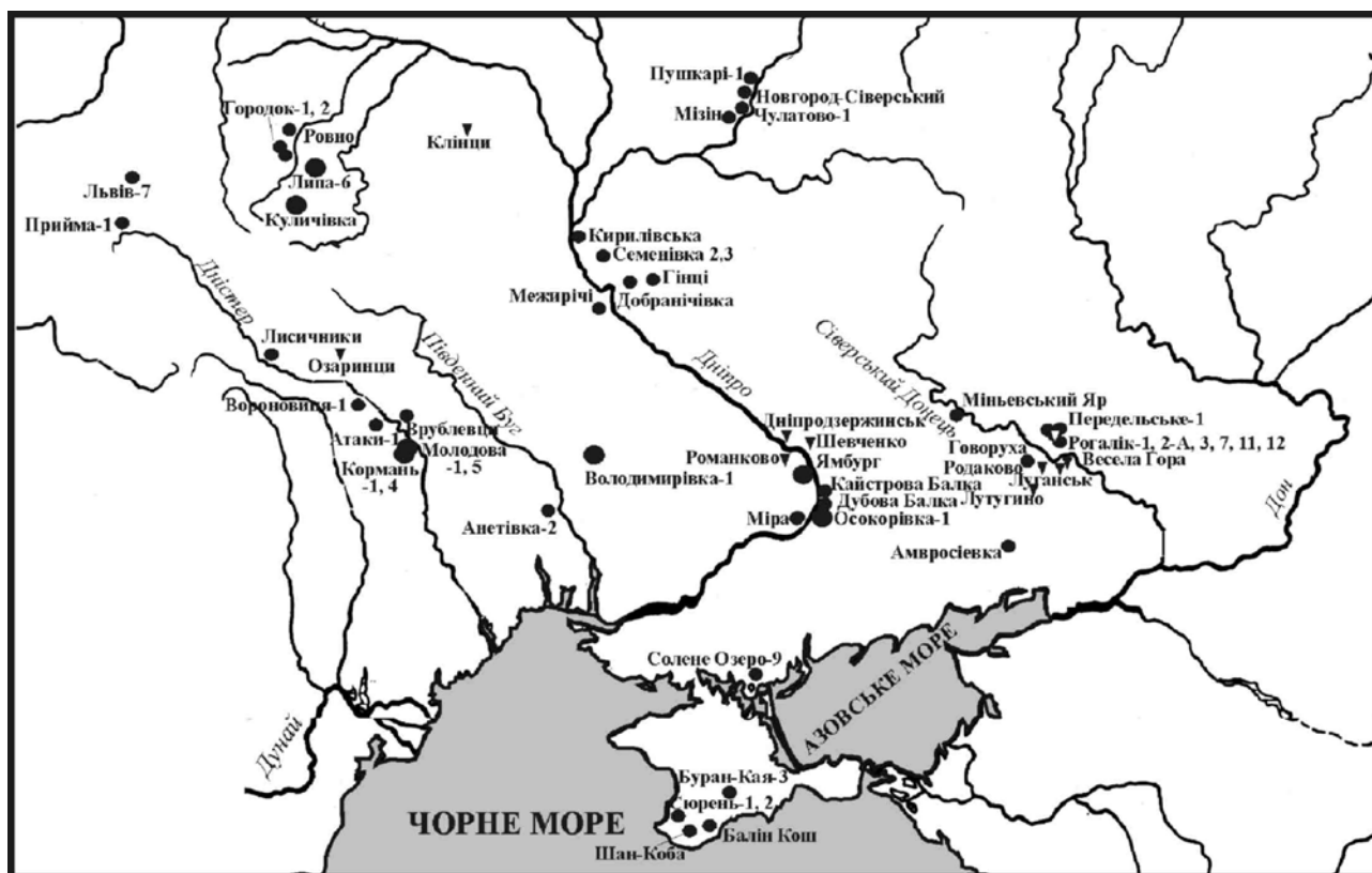
Fig. 1. Map of the Late Paleolithic sites with the subjects of art in Ukraine.