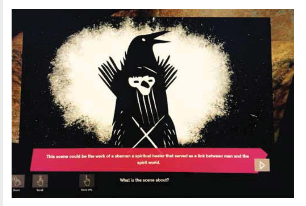
Fig.1 - Reproduction of the Lascaux shaft scene, Lascaux III