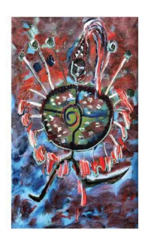
Fig.1 - The petroglyph from Oglakhty in southern Siberia (after Kyzlasov, Leontev, 1980, Narodnye risunki khakasov, Moscov, p. 144) and the painting Shaman'd drum (1990) by Alexander Domozhakov, inspired by the petroglyph