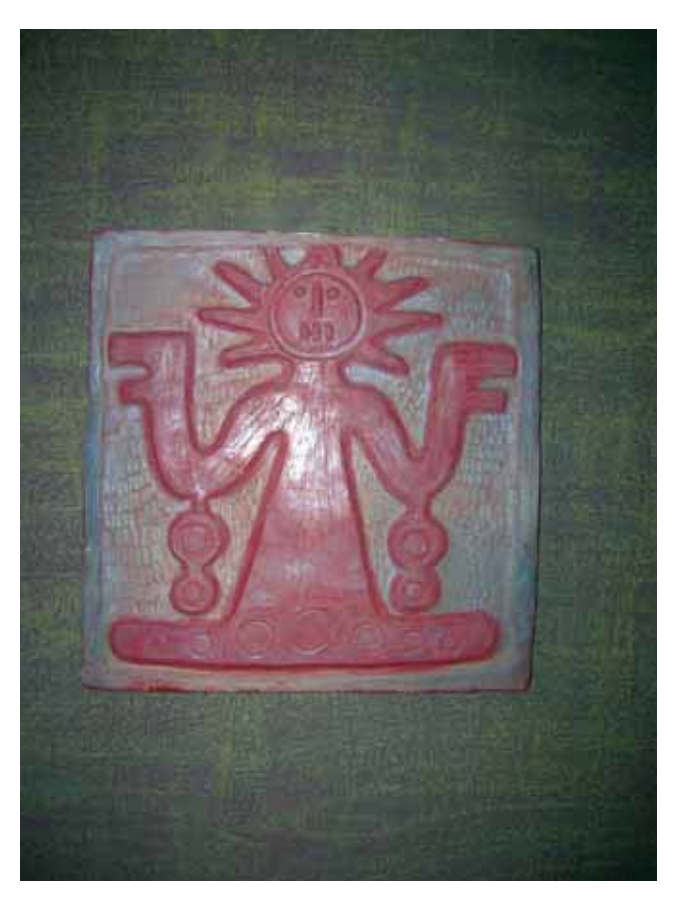
Fig. 1 - Lord of the Scepters. La Bajada archeological site, Atacama Desert zone, Il region of Chile.

Keywords: anthropomorphic rock art icons, authority representations in rock art