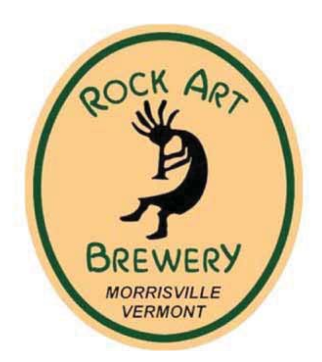
Fig.1 - Appropriated rock art images - such as this kokopelli figure - are often used for commercial purposes

Keywords: Indigenous identity, rock art, appropriated images