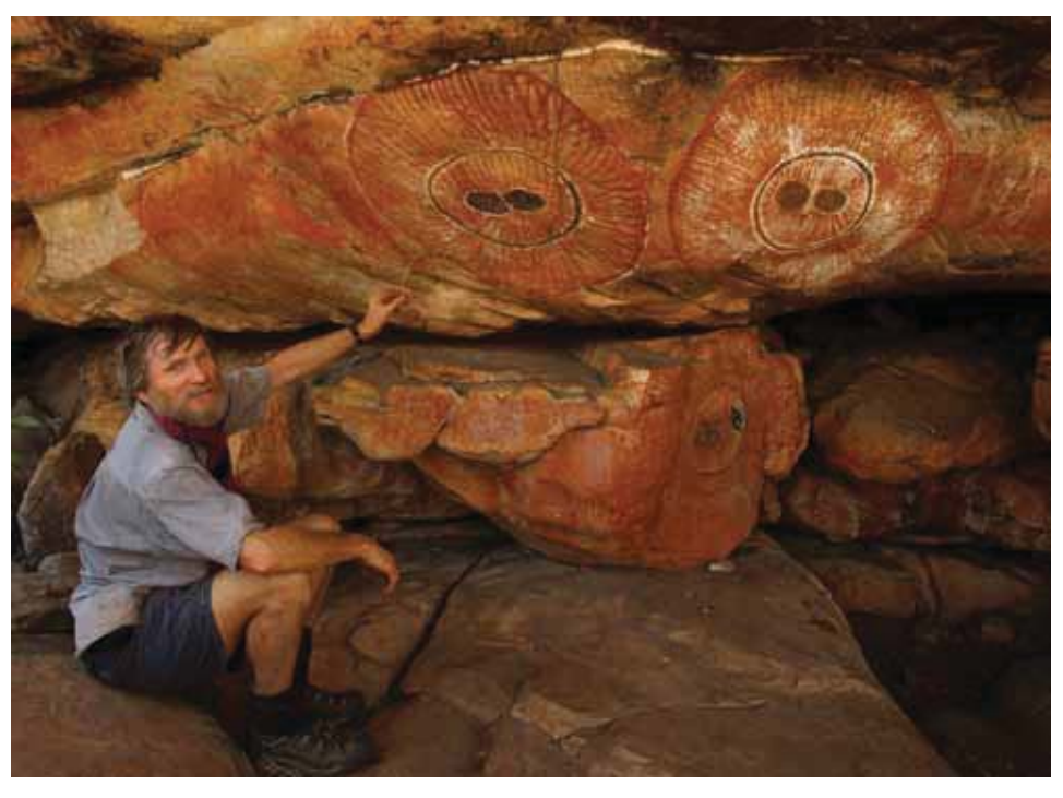
Fig.1 - Wanjina Rock Drysdale River. (© Joc Schmiechen)

Fig.2 - Sunburst Wanjina King Edward River. (© Joc Schmiechen)