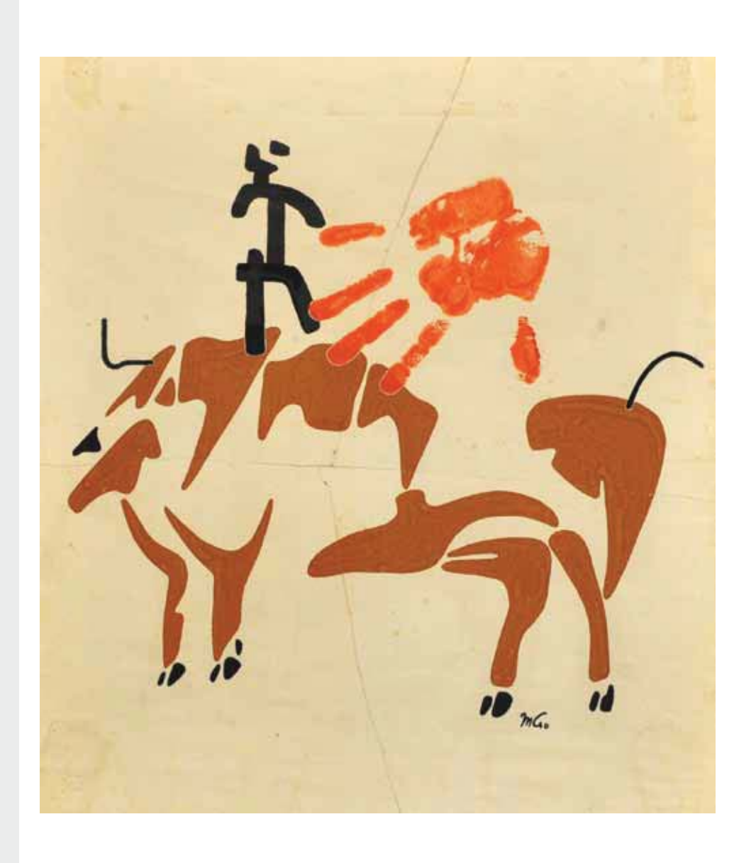
Fig.1 - Sketch for an Altamira's promotional poster of Mathias Goeritz. 1948.

Keywords: Altamira, rock art, contemporary art, inspiration