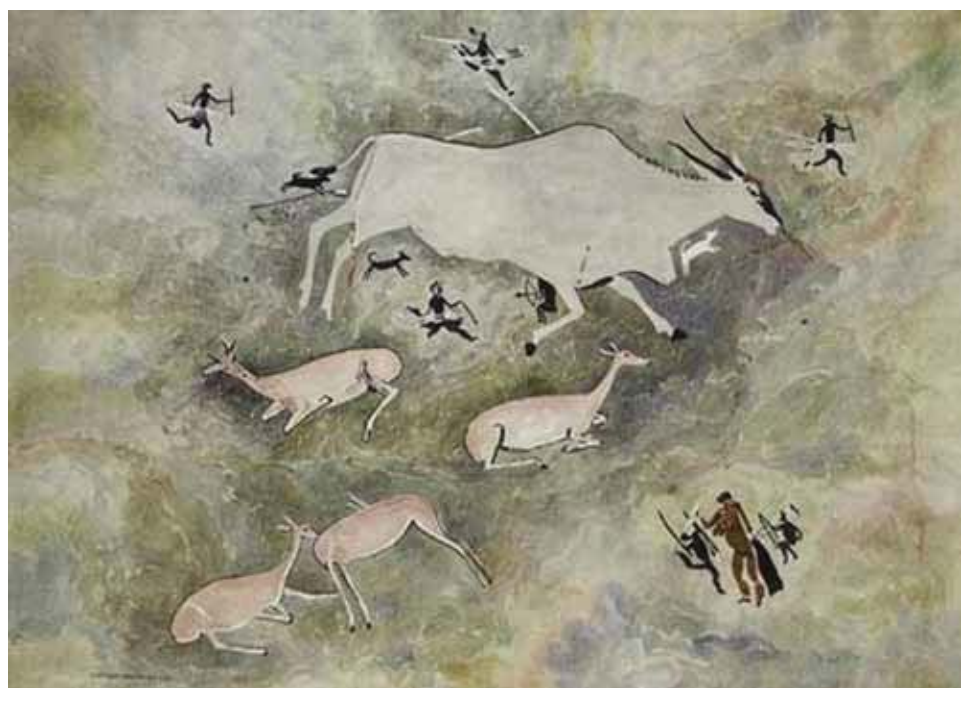
Fig.1 - Rock art in the Stormberg Mountains.

Fig. 2 - Walter Battiss (1902-1982). Figures & Buck, Watercolour, 57 x 81cm.