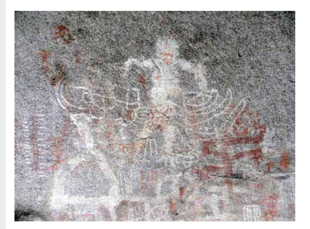
Fig.1 - Pedra da Lua site, Brejo da Madre de Deus, PE, Brazil.

The objective of this work was to formulate new parameters to categorize the analysis of Tradição Agreste based on the identification of the essential elements that characterize it. Defining the parameters for this rock art tradition was carried out through the study of the rock paintings, which were analyzed from the three perspectives: thematic, technical and scenographic. Within the thematic analysis two categories were used: representational and abstract. In the technical analysis three categories were used: trace thickness, contour lines and support treatment. In the scenographic analysis the composition of the space, morphology, size, proportionality, movement, fill and color were considered. These categories allowed for categorizing the characteristic elements of this tradition at an operational level. Within the sites studied there are the common aspects of theme, scenography and technique, represented by: a) Cognitively recognizable figures; b) Anthropomorphic and zoomorphic figures represented distorted from the morphological and postural point of view; c) Abstract figures with thick traces with modal values varying from 0.70 cm to 1.90 cm, completely filled and with irregularities in the contour lines; d) Intensively painted graphic spaces exhibiting figures that appear, in a dominant way, grouped but not related to each other, characterized by individualized figures.