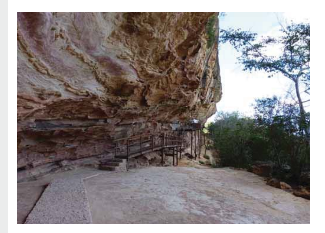
Fig.1 - Ema do Sítio do Brás archeological site.

For more than a decade, the Instituto do Patrimônio Histórico e Artístico Nacional (IPHAN) and Fundação Museu do Homem Americano (FUMDHAM) have been developing different joint heritage preservation actions, including the preparation of archaeological rock art sites for public visitation. The Park and its surroundings have more than 1,000 archaeological sites registered with the CNSA (National Register of Archaeological Sites) of the IPHAN, of which 200 are prepared for visitation, with 16 sites prepared for visitors with reduced mobility. With the present work we present how the actions of preservation of this rock art set were programmed and executed, especially as the different infrastructure alternatives were proposed, attending to the specificities of each site, aiming, in this way, to make possible the better conditions of access and preservation of this cultural heritage.