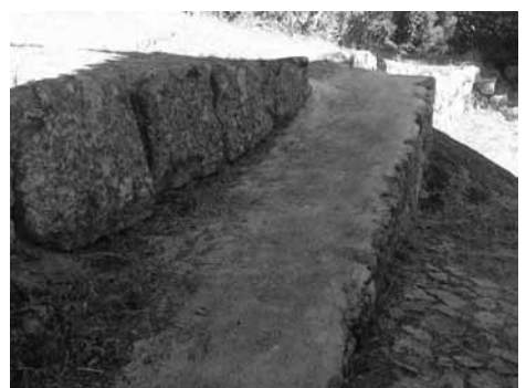
Fig. 6 - A "ramp" at São Salvador do Mundo Sanctuary, São João da Pesqueira