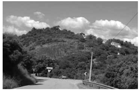
Fig. 5 - Access to São Salvador do Mundo Sanctuary, São João da Pesqueira