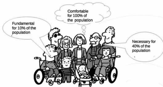
Fig. 1 - Adapted from Accessible Portugal ( http://www.accessibleportugal.com/en/ )

recent decades, pine and eucalyptus. In 2001, UNESCO declared 240,000 hectares of the area a World Heritage site, classifying it as a “cultural landscape”.