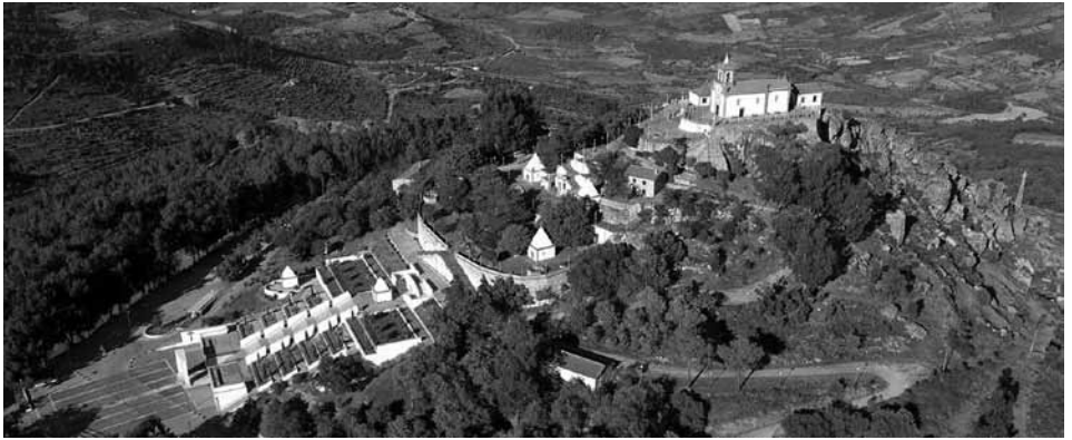
Fig. 2 - Vila Flor, Sanctuary of Nossa Senhora dos Anúncios