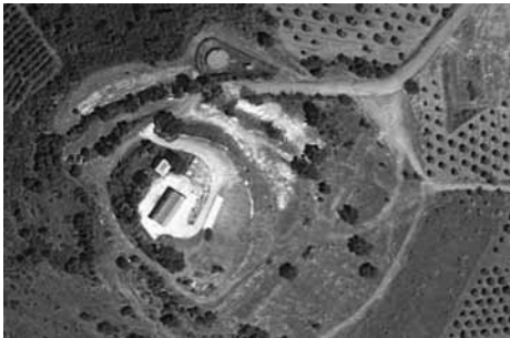
Fig. 3 - Alfândega da Fé, Sanctuary of Nossa Senhora dos Anúncios, aerial view (Adl. google maps)