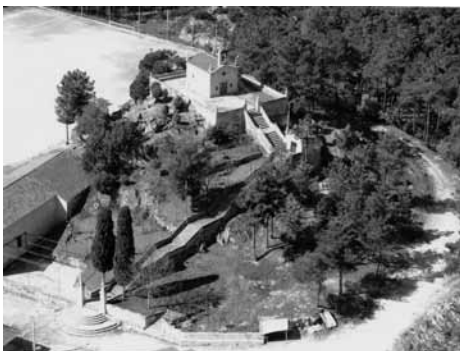
Fig. 4 - Car access to Sanctuary of Nossa Senhora dos Aflitos, Pegarinhos, Alijó