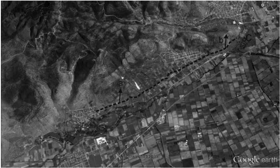
Fig. 1. A Possible route of the conduit. a. Kefalari b. Philippi. C. Archaeological area of Philippi.

In order to supply Philippi with water a distribution system was constructed, which dates from the Age of the Antonines (2 nd c. A.D.).