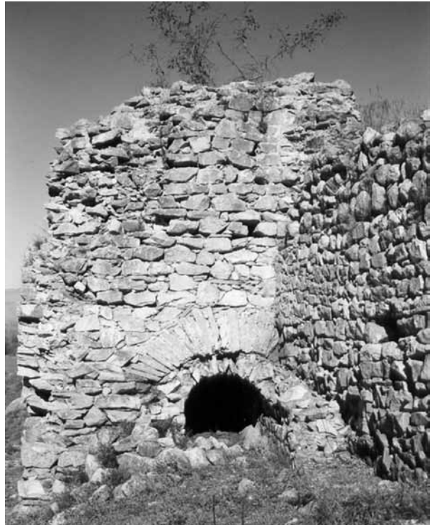
Fig. 3. The conduit in Philippi.