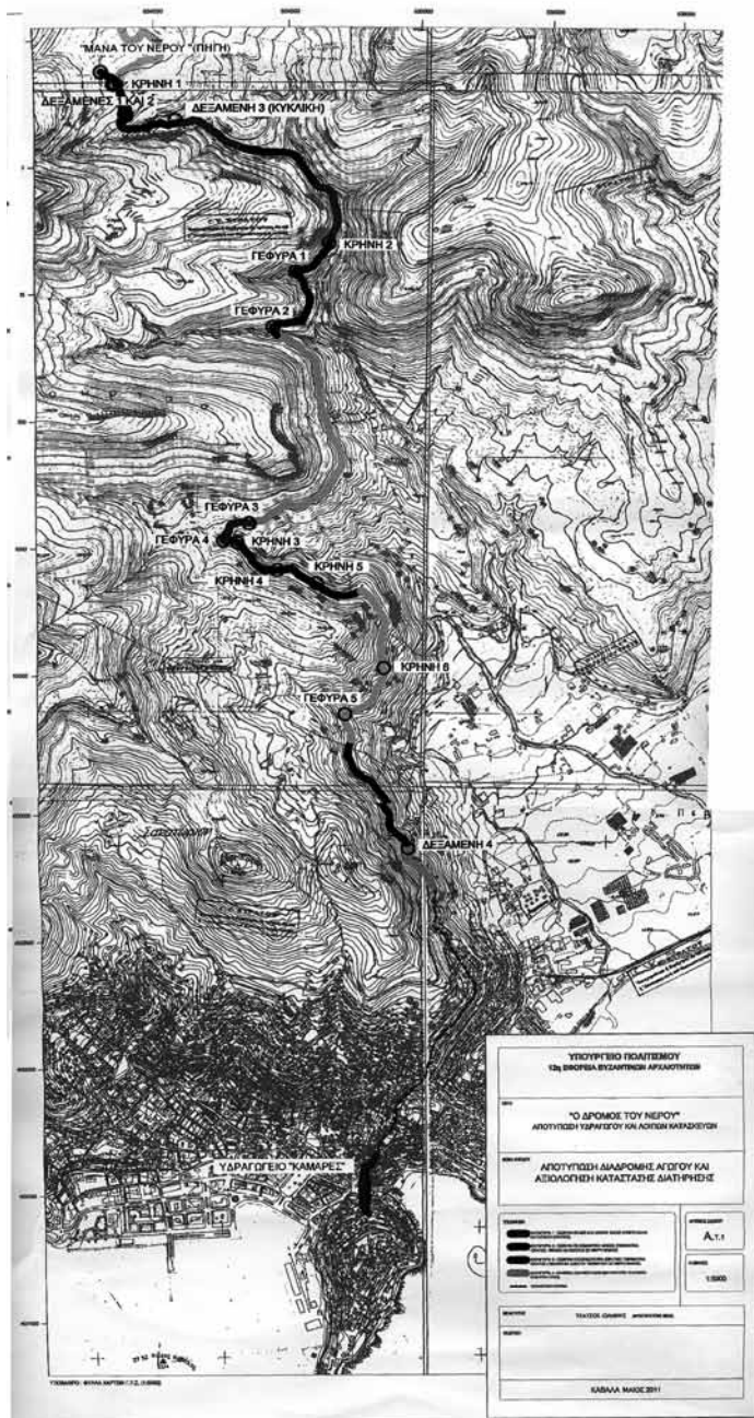
Fig. 4. Map of the Water supply system of Neapolis-Christoupolis-Kavala.