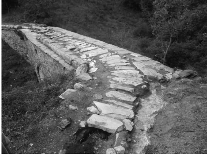
Fig. 5. Bridge along the Water supply system.