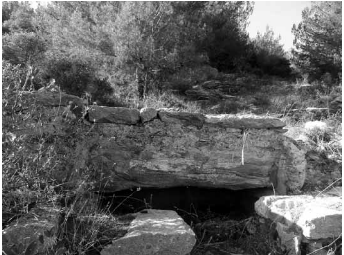
Fig. 6. Fountain no 5.

etation. The path is 0.90m. wide. The width of the conduit fluctuates between 0.30m and 0.50m and is 0.20m deep. The conduit is covered with flat and rough slabs measuring 0.80m x 0.30m x 0.07m and 0.30m x 0.50m x 0.15m. The joints between the slabs were reinforced with mortar. As a result the conduit was protected from debris.